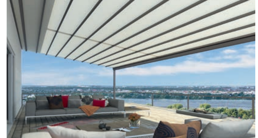
Frame colour WT 029/70786 | Pattern Pergona® transluzent PE 90W (white)

The special feature of the weinor Pergona® translucent fabric is its high light transmission of up to 21%. Natural light is able to penetrate the rainproof support fabric, but it prevents unpleasant dazzling by strong sunlight at the same time. Highstrength polyester fibres make the woven fabric extremely durable, long-lived and weather-resistant.