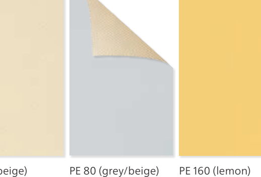
PE 170 (raspberry)