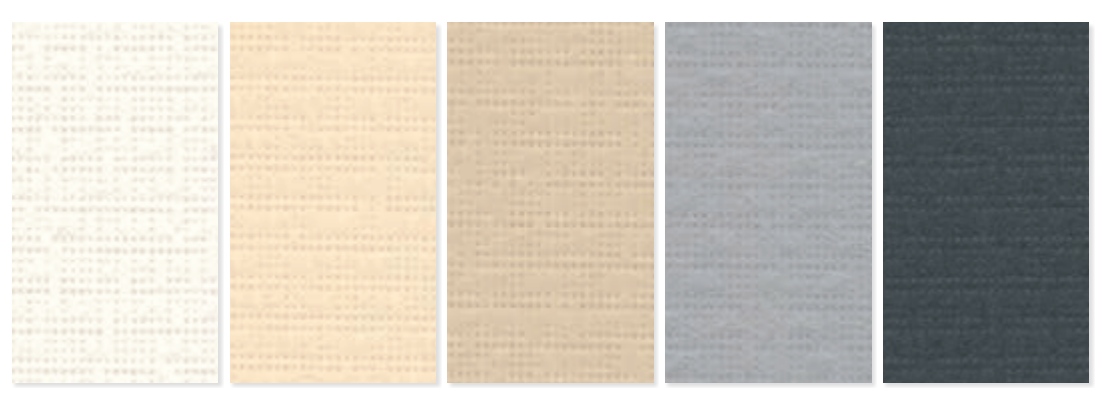
PE 90W (white)